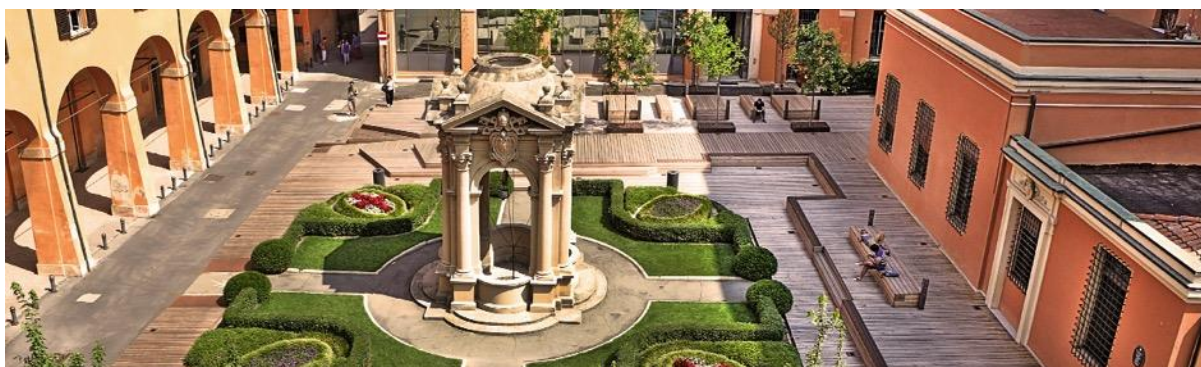
Courtyard Of Palazzo D'accursio.