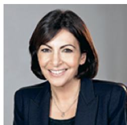
Anne Hidalgo Mayor of Paris