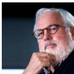
Miguel Arias Cañete EU Commissioner Climate Action & Energy