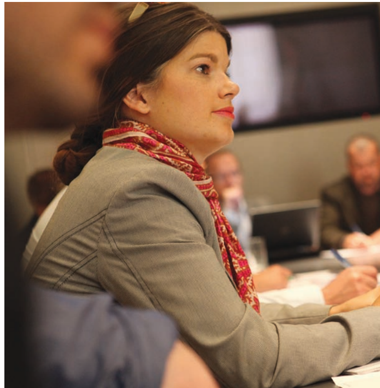
Climate-KIC events bring the community together to share ideas and learn from each other

Climate-KIC receives EIT funding up to 25 per cent with the remainder provided by partners, external sources and commercialisation.