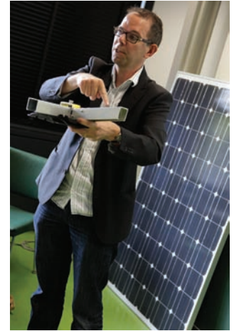
Students experience climate innovation with European professionals