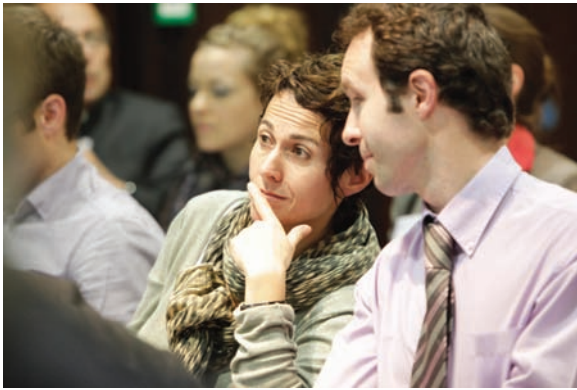
Business start-ups and partners are supported and connect through Climate-KIC