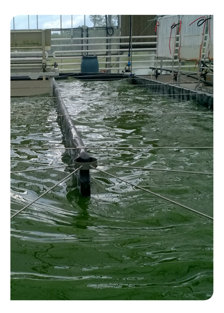
Image 2: The open-pond system tested in the project was provided by Zöldségcentrum Ltd and it was developed in Vegaalga project under grant agreement No. 673023

In that sense, industrial wastewater could be a better source of raw material as, unlike municipal wastewater, it can be strictly controlled. "In industrial wastewater, they know what is inside," Gyalai-Korpos says. "If you produce something from controlled-origin waste water, you can probably go for a higher market value." While still an assumption that needs to be tested, industrial wastewater-derived algae biomass could potentially facilitate easier entry into highly regulated markets like the food industry, for example.